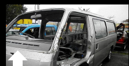
The old van got trashed

Judging our OSCAR children at our local talent quest in the July 2013 Holiday Programme.